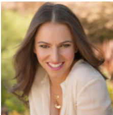
Marni Your Personal Wing Girl